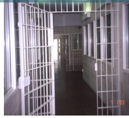
Reaching behind bars with The hope of the gospel